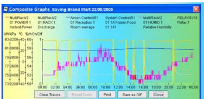
Composite graphs allow comparison of different parameters

* Pressnet lite contains most of the features of Pressnet, the main exceptions being memory limitations (8MB) and recording timebase ( 5 minutes compared to 1